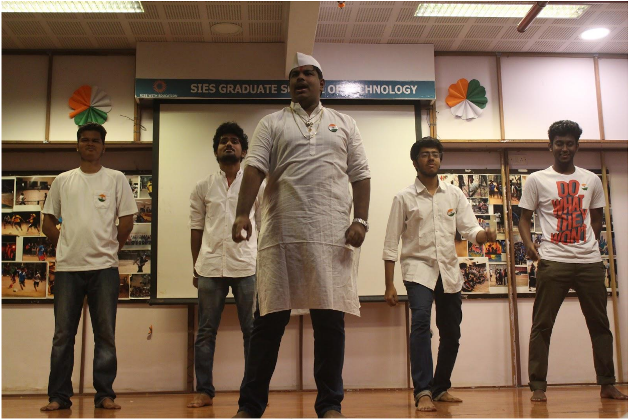
Pic 6:- A still from the skit.