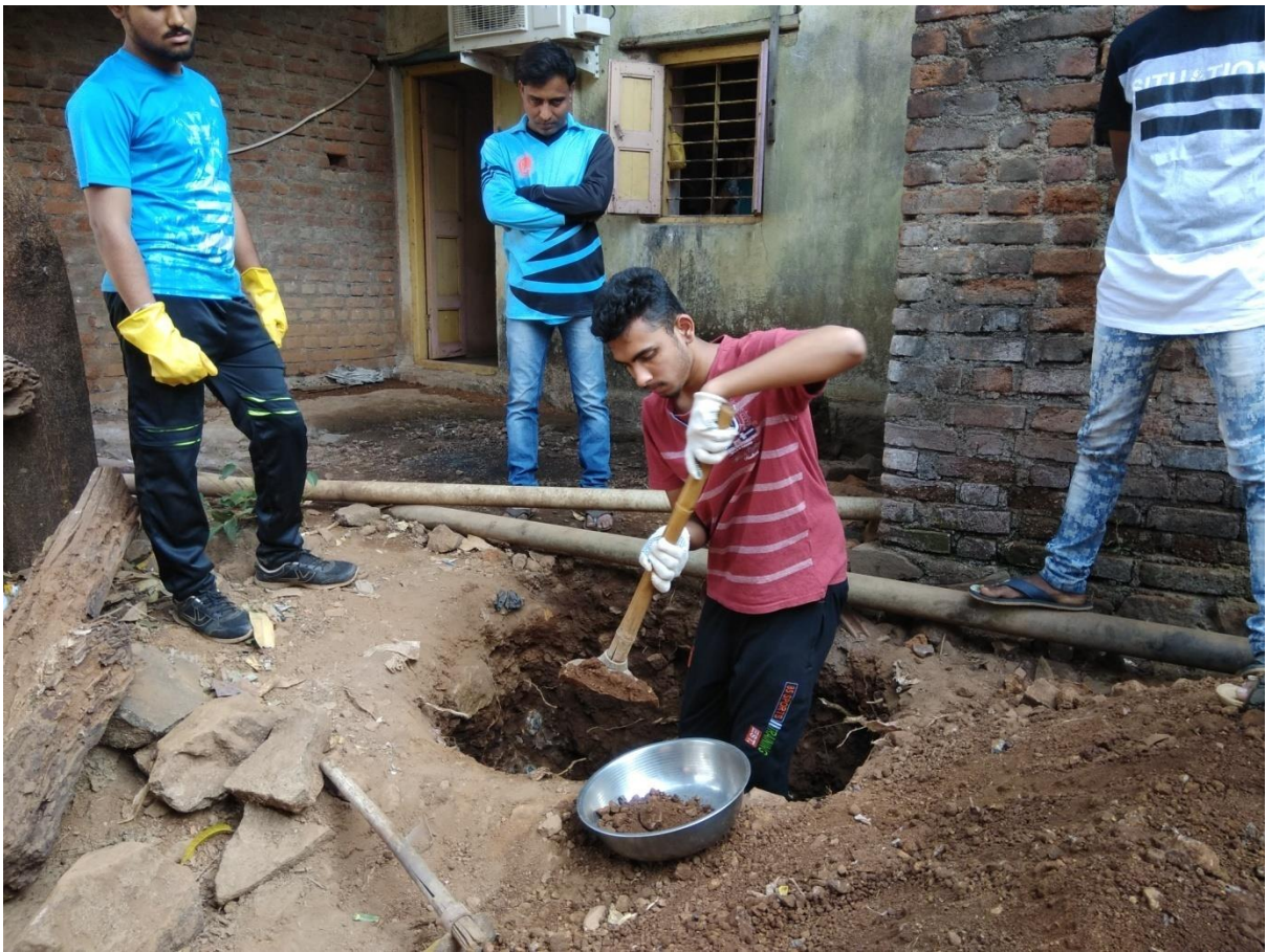
Soak Pits @ Camp Site