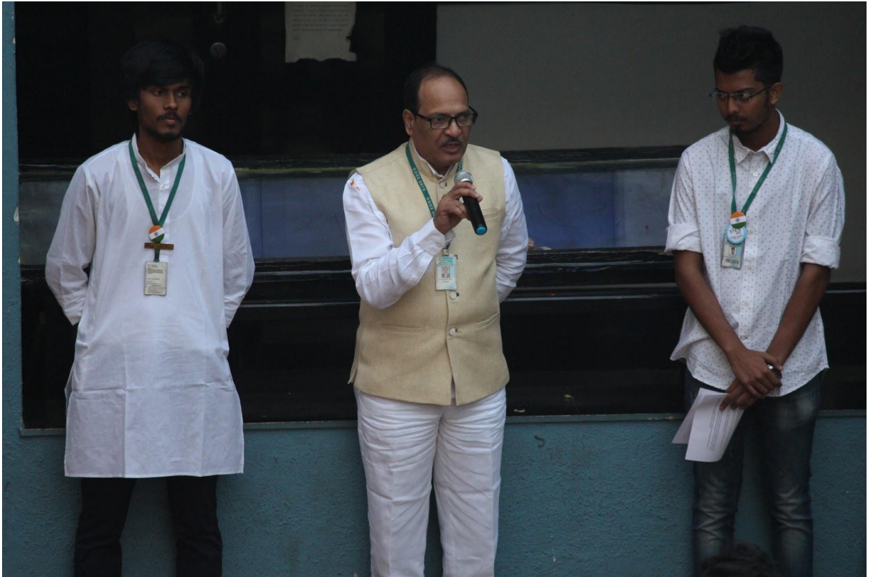
pic2:- Principal sir addressing the crowd.