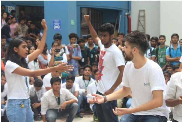
Pic 1: A picture showing a girl trying to make a boy get up the seat in a bus even when he is injured.

On the 25 th of September 2017, two street plays were conducted by the volunteers of the NSS unit. Both the street plays begun during the break session at around 1pm prior to which a rally was carried out in the college campus stating everyone in the campus to come and watch the act. Both the street plays covered important issues of the modern society. The first street play's topic was pseudo-feminism.