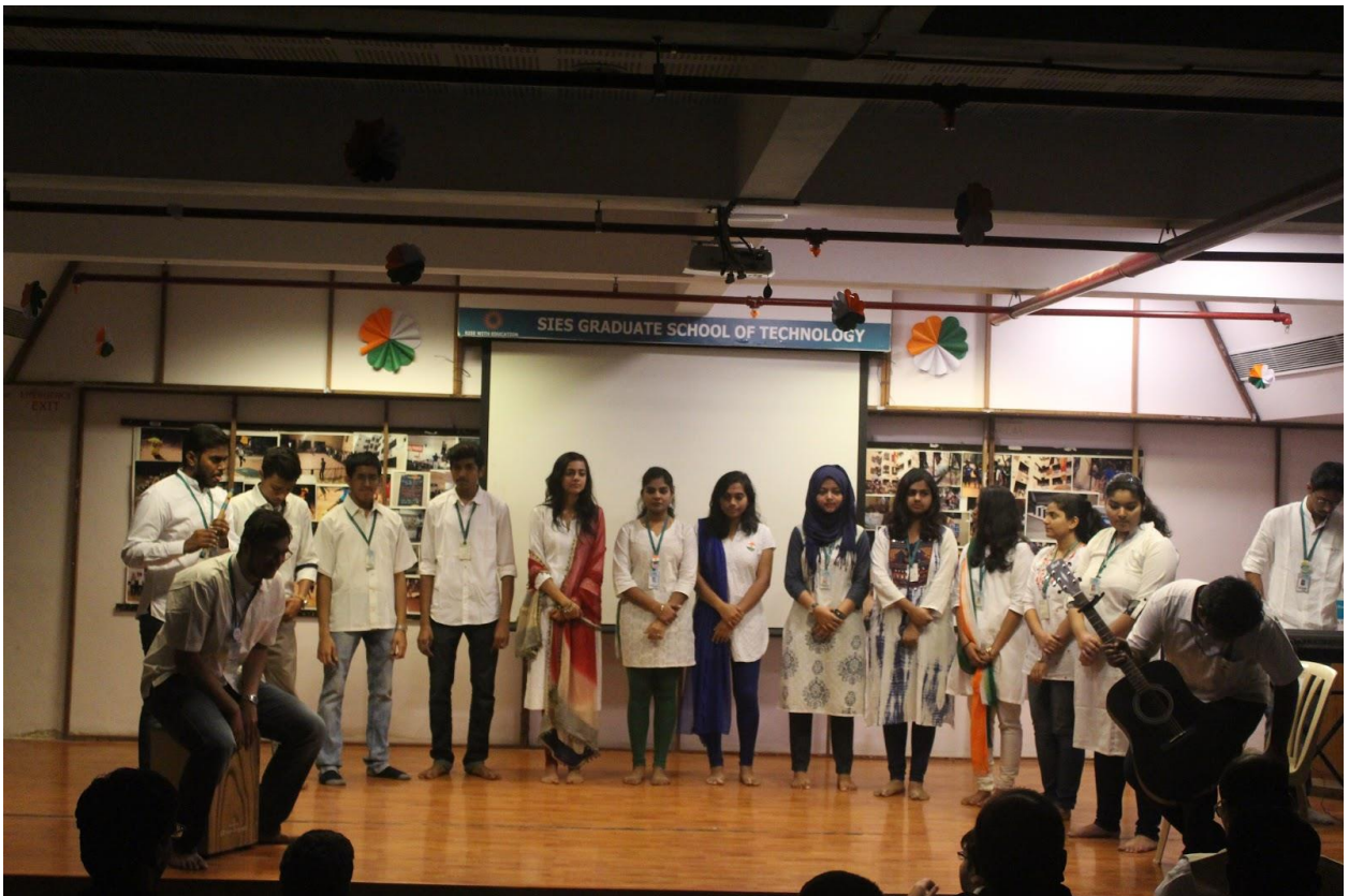
pic3:- The music club of SIESGST performing in front of a full house.