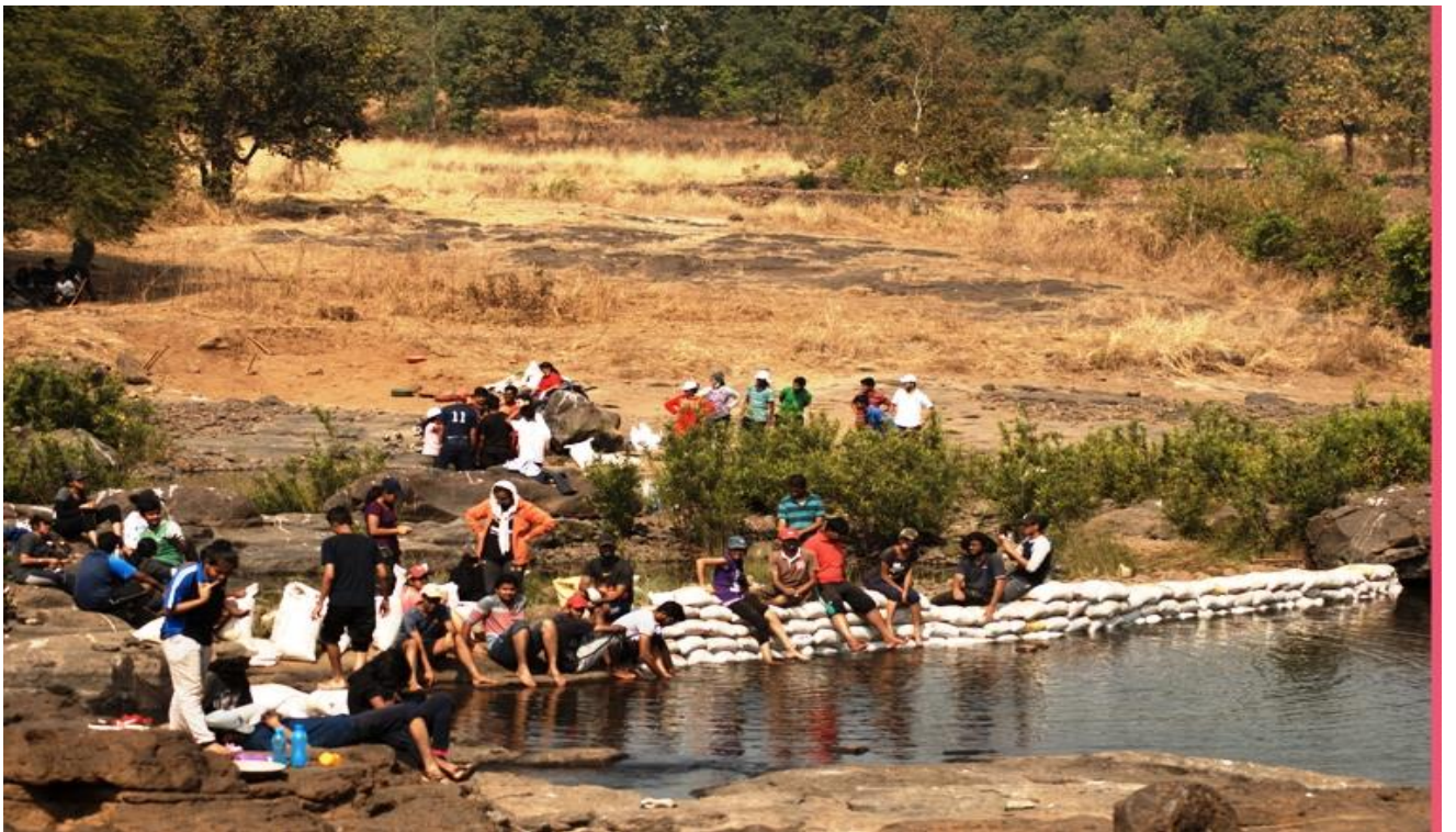
WORKING ON DAM 1