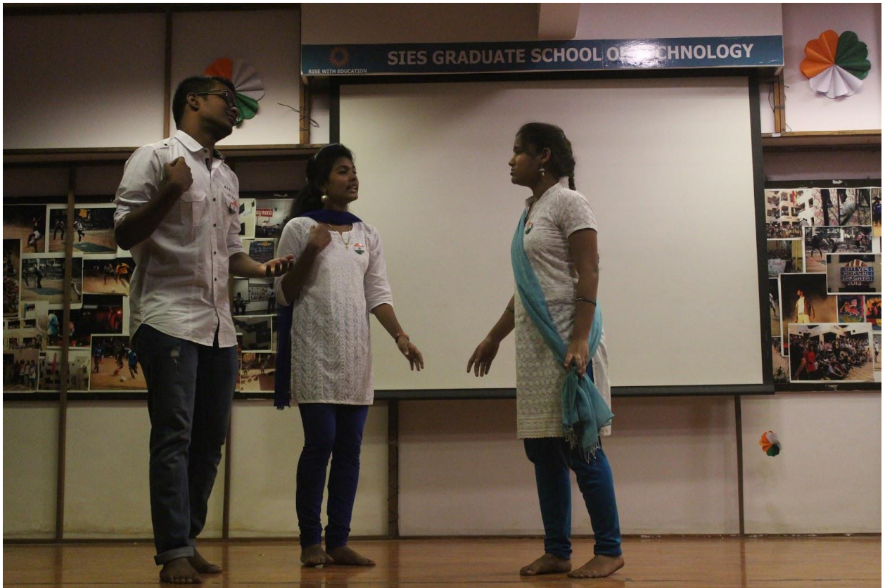
pic4:- The NSS unit performing a skit.