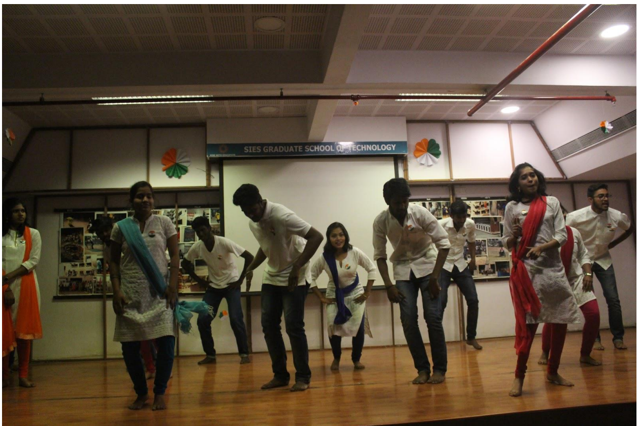
pic5:- A still from the skit.