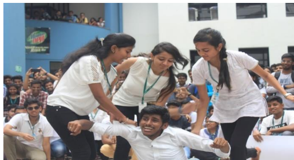
Pic 2:The scene displaying the girls using their learntSelf defence techniques on a 'roadside Romeo'.